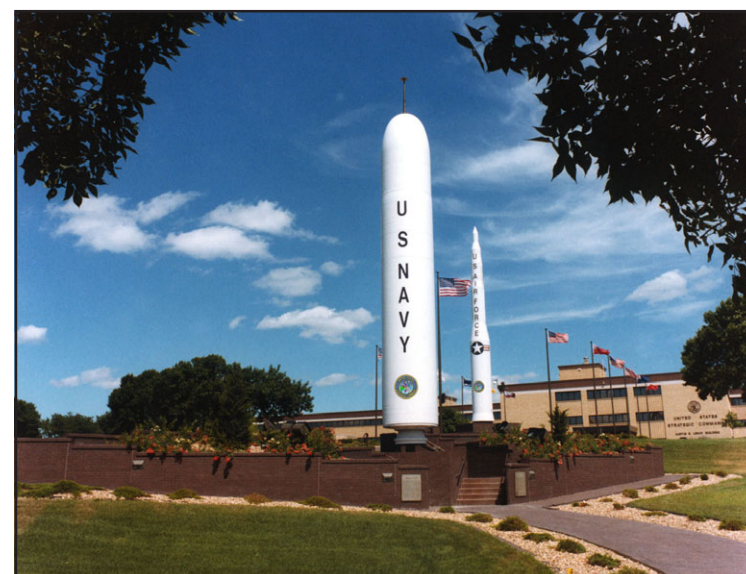
USSTRATCOM Headquarters at Offutt Air Force Base