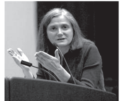
Amy Goodman, host of Democracy Now! , addresses a Lincoln audience at the May Riepma Ross Media Arts Center in April 2005.

Now airing on Nebraska's first-and-only non-profit, community radio station, KZUM 89.3 FM: Monday-Friday, Noon-1pm.